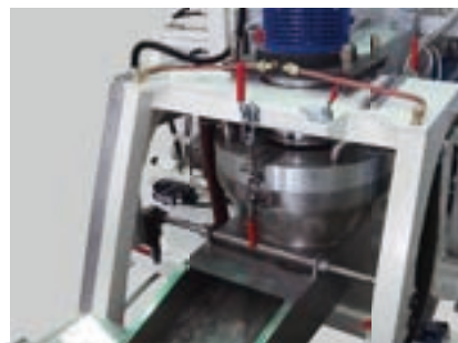
Die Face Cutting Unit